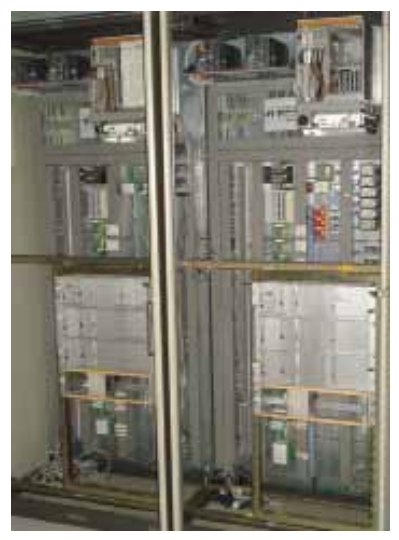
GT-201 and GT-501 panel

CAP requested a panel-mounted HMI for the GT/GB201 to be able to view and control GT/GB501 and vice versa. This feature was not available in their old Simadyn OCP. A new Human Machine Interface (HMI) with a panel-mounted touchscreen PC was therefore added to the GB-201 and