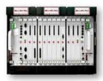
MicroNet Plus Redundant